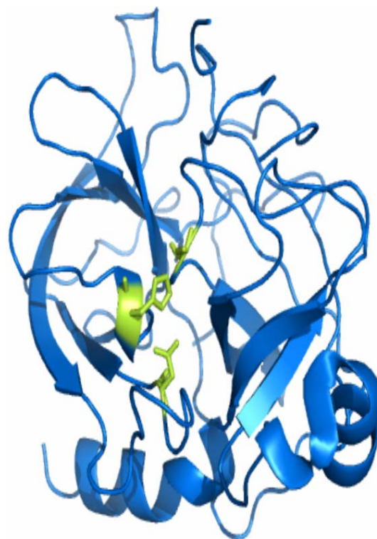
Fig. 2 Crystal structure of bovine chymotrypsin. The catalytic residues are shown as yellow sticks. Rendered from PDB 1CBW.

The phytocystatins (5 - 87 kDa) present characteristics found in the cystatin subfamilies I and II (Arai et al. , 2002). Most phytocystatins have a molecular mass in the 12 - 16 kDa range and are devoid of disulphide bonds and of putative glycosylation sites. Several cysteine proteinase inhibitors have been identified and their primary and