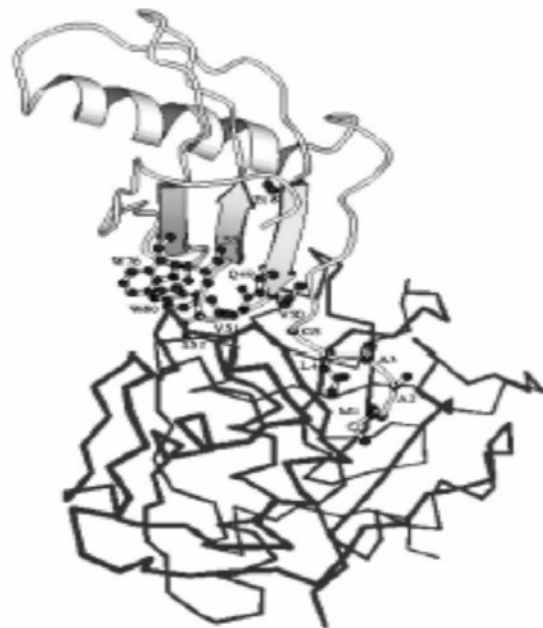
Fig. 1 Molscript diagram of the final model of papain, in complex with CCPI (cowpea cystatin proteinase inhibitor). The papain portion (below) is shown as a gray C \alpha trace and the cystatin (above) as a ribbon diagram. Side chains of cystatin residues interacting with the enzyme are drawn in a ball-and-stick representation and labeled. The orientation was chosen to clearly display the role of the inhibitor N-terminus, leading to partial concealment of residue Glu 18 (Aguiar et al. , 2006).

Serine proteinases are widely distributed in nearly all animals and microorganisms (Joanitti et al. , 2006). In higher organisms, nearly 2 % of genes code for these enzymes (Barrette-Ng et al. , 2003). Being essentially indispensable to the maintenance and survival of their host organism, serine proteases play key roles in many biological processes. Serine proteases are classically categorized by their substrate specificity, notably by whether the residue at P1: trypsin-like (Lys/Arg preferred at P1), chymotrypsin-like (large hydrophobic residues such as Phe/Tyr/Leu at P1), or elastase-like (small hydrophobic residues such as Ala/Val at P1) (revised by Tyndall et al. , 2005). Serine proteases are a class of proteolytic enzymes whose central catalytic machinery is composed of three invariant residues, an aspartic acid, a histidine and a uniquely